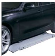
Low profile platforms.