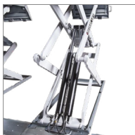
Double ram safety system.