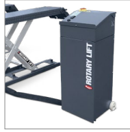
Ergonomic control panel.