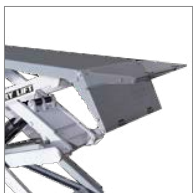
Folding ramp extensions.

The low-profile double scissor lift DS35HG has been specially designed for the service and repair sector. The newly designed flexible mounting platforms allow for a broad mounting range.