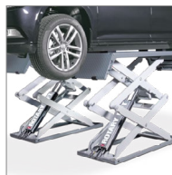
Broad mounting range.