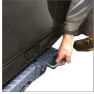
Folding ramp extensions.

The Rotary Low Profile scissor lift specifically covers the requirements in the field of tyre and body work services. However, it is also an ideal workplace for maintenance work and work on the vehicle interior in the workshop. A reasonable investment allows the quick set up of an additional universal workspace without foundation work.